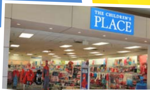
The Children's Place