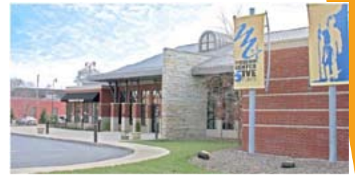
The Museum Center at Five Points