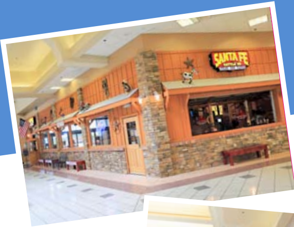
Santa Fe Cattle Company