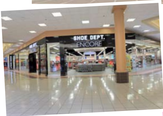
Shoe Dept. Encore